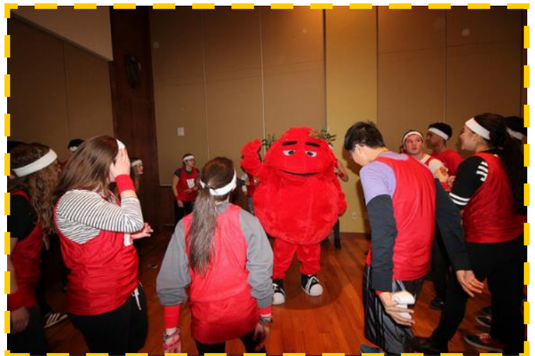
AT RIGHT: WAYLAND STUDENTS PARTICIPATED IN SPIRIT AT STATE CONVENTION.

Wayland Academy has been in school again for 2 weeks. We've had four meetings so far this year, and the energy is very good. We have many fresh-faced first year students attending already, and some of our returning 2s, 3s, 4s have also joined the club. We've signed up to do concessions at three volleyball games as a fundraising effort for convention. We are excited for a new year and can't wait for the instructions for the war machine to be posted so that we can begin preparing for it along with our scrapbook, t-shirt, and Certamen teams. Carthago Delenda Est.