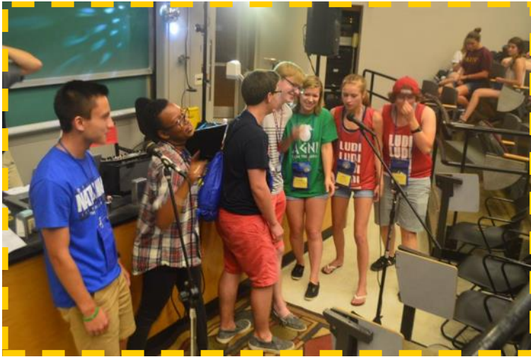
ABOVE: ALL THREE CMH NATIONALS DELEGATES, ALONG WITH OTHER WJCLERS AND AN OJCLER, SANG "WAKE ME UP" AT THE TEAM TRIVIA AND KARAOKE EVENT.

To say the CMH Latin club had an exciting year is an understatement. For the first time, we have an officer on the board, won state Certamen, and, most recently, attended Nationals. We've truly grown from a club with ten members whose "president" was whoever walked in the door first. This upcoming year, we have a lot more in store.